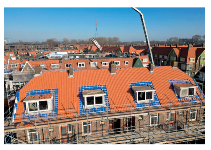
Aerial photo of the Starting block.

A project plan for the renovation has been developed in consultation with the Yellow blocks residents' committee. This project plan was personally delivered to tenant in December 2022. They were then asked to vote on whether or not to approve the plan. We are pleased to report that more than 70% of the tenants in the Yellow blocks have approved the project plan. In legal terms, this means that the proposed plan is reasonable, and that we may implement it for all of the homes in the Yellow blocks. We expect to commence renovations in January 2024. In 2023, tenants who wish to return can choose a new floor plan for the home and decide whether to keep their bayonet room (the room on the first floor that belongs to the home on the ground floor). Tenants who do not wish to return can seek alternative housing in 2023 by means of an urban renewal permit. They will also have the option to move to a renovated home in the Gentiaan district, and Ymere will help them to arrange this. Individual interviews with residents have begun.