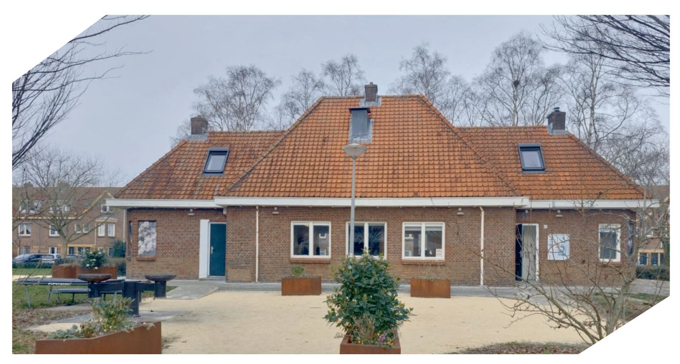
Ymere's district office at Meidoornplein 40.